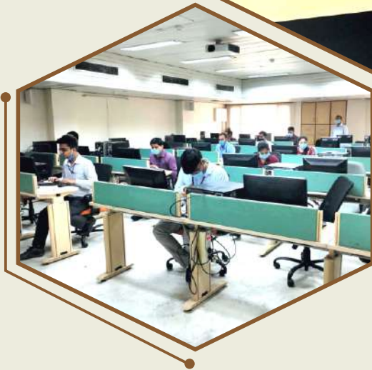
English Stenography Test for PAs & Stenos in progress