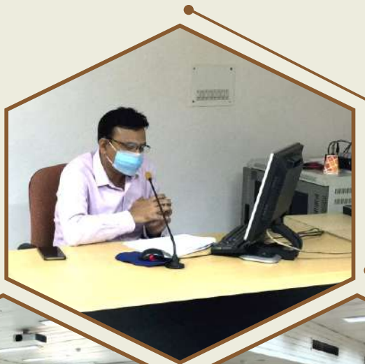
Speaker addressing on webinar to participants of the Promotion-related Training Programme