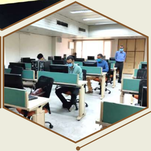
Typing Test for ASOs in progress