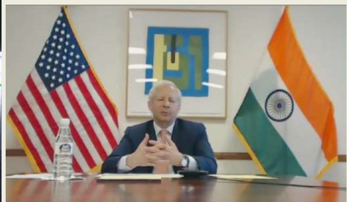
▼ H.E. Mr. Kenneth I. Juster, Ambassador of US to India interacted on webinar with the IFS OTs