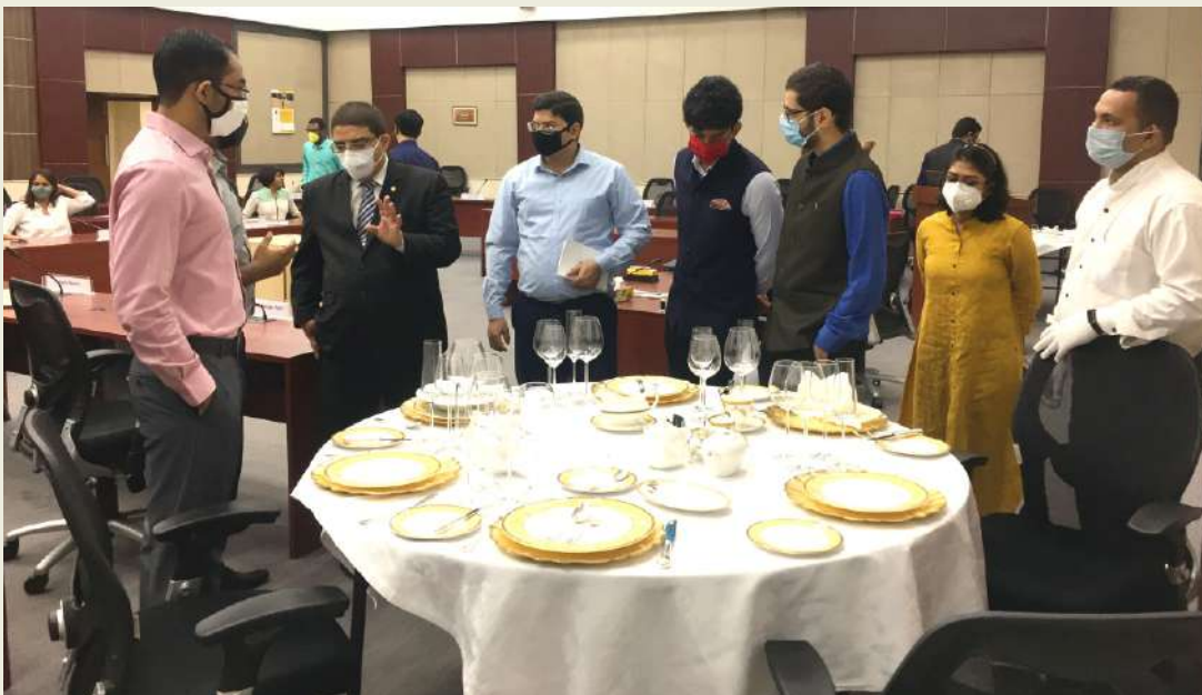
'Workshop on Hospitality' for the IFS OTs conducted at Hotel Taj Palace, New Delhi