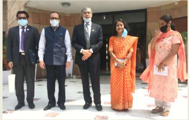
H.E. Mr. Muhammad Imran, High Commissioner of Bangladesh to India visited SSIFS to discuss bilateral issues of cooperation and training related matters.