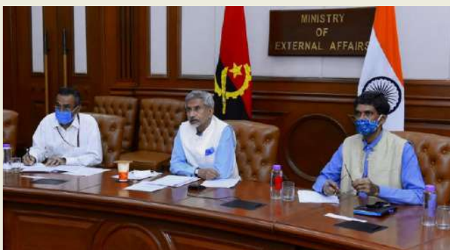
MoU with Angola signed on the margins of 1 st India-Angola Joint Commission Meeting