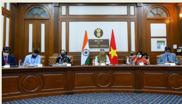
MoU with Vietnam signed on the margins of 17 th India-Vietnam Joint Commission Meeting