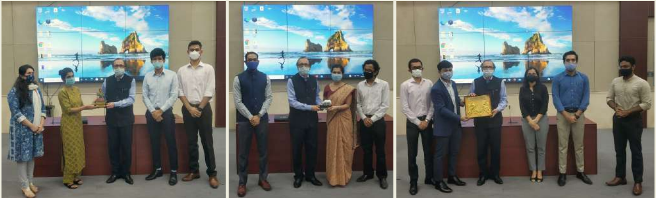
IFS OTs handover insignias to Dean (SSIFS) which were received by the respective groups during their Army Attachments