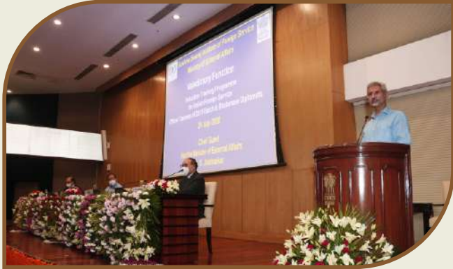
EAM addressing the IFS OTs

A valedictory ceremony was organized on 24 July 2020, which was presided over by Dr. S. Jaishankar, Hon'ble External Affairs Minister (EAM) as Chief Guest. Shri V. Muraleedharan, Hon'ble Minister of State for External Affairs (MoS) and Shri Harsh V. Shringla, Foreign Secretary participated as Guests of Honour. Awards were given on the occasion to deserving OTs of the 2019 batch.